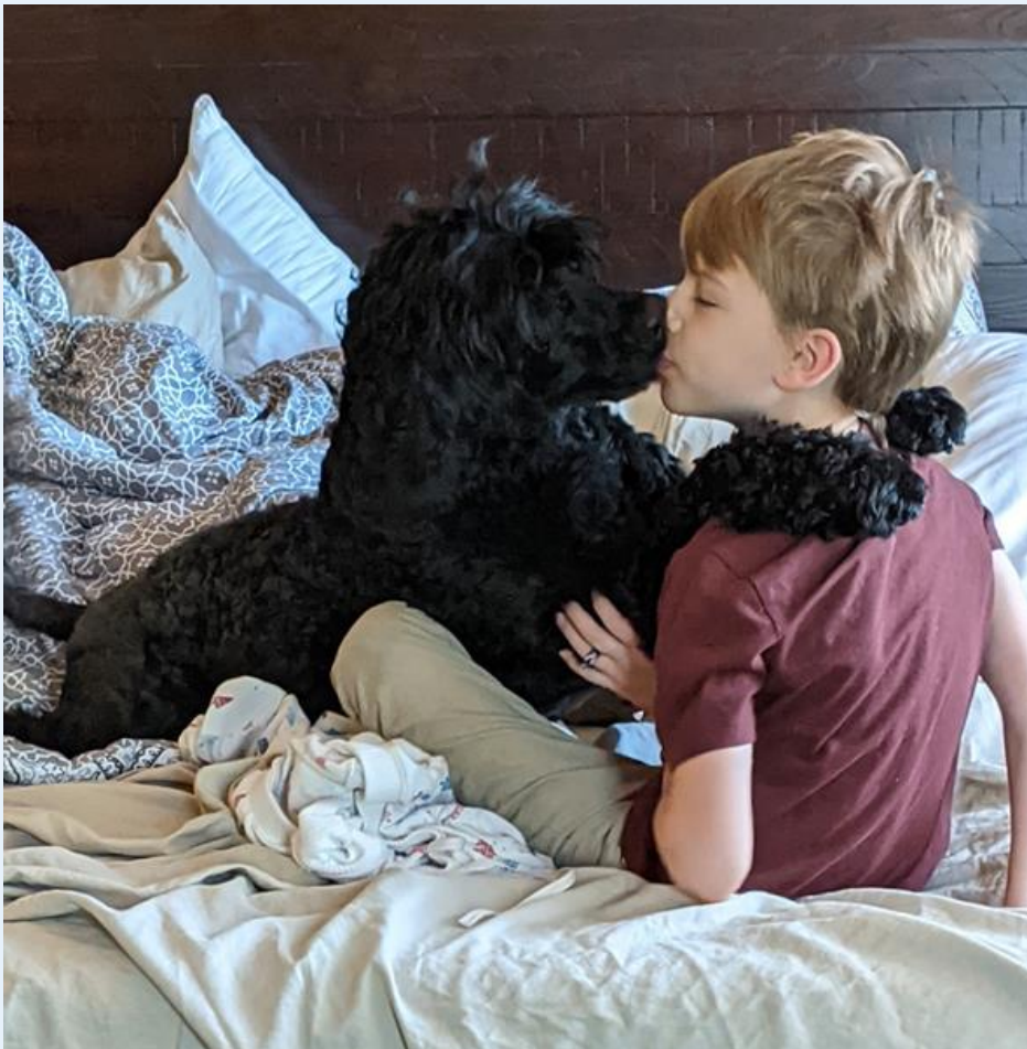
Nori's secret weapon: the lick-attack