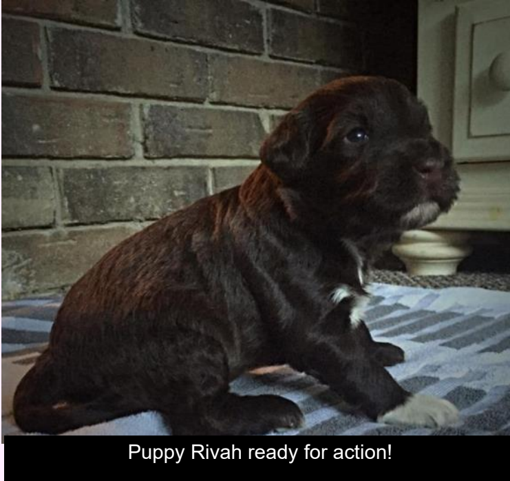
Puppy Rivah ready for action!

We were already working on basic stuff in the hotel room in St. Louis: sit, her name, board the boat (bed). And she loved the work. The day after we got home we started searching for "primary" (food) in containers. Yes, she was just eight weeks old. We continued searching for food hides for several months. It can