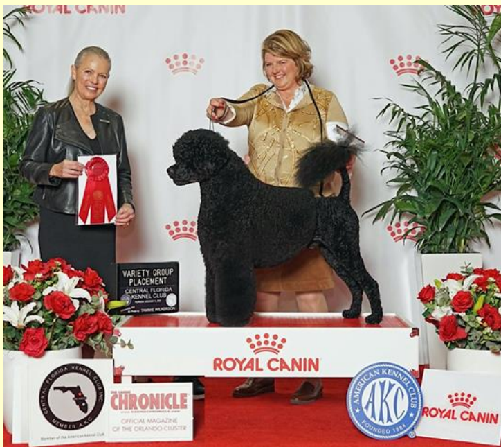
Sonny wins again!